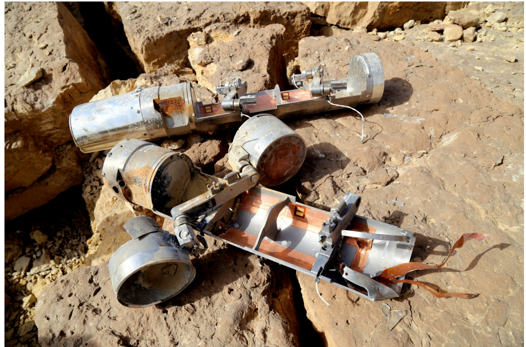
Failed Sensor Fuzed Weapons Yemen 2015